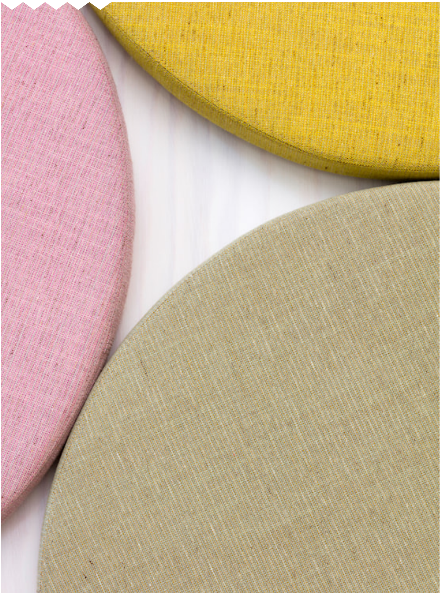
HARPER Upholstery fabrics